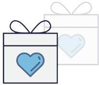
MAKE A GIFT TO YOUR DAF