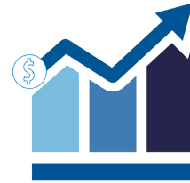
GROW THE BALANCE